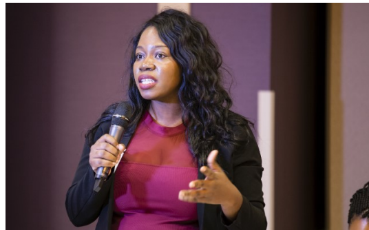
A participant poses a question.