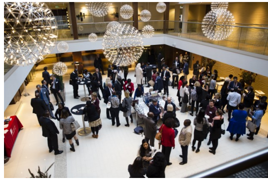
Participants take a break.