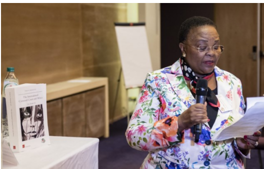
H.E. Judge Sanji Monageng launches The International Criminal Court and Africa: One Decade on , Evelyn A. Ankumah (ed.).