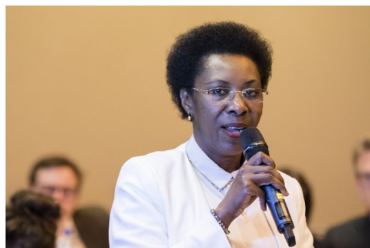
The Ambassador of Burundi to the Netherlands makes an attempt to explain why Burundi took the decision to withdraw from the ICC.