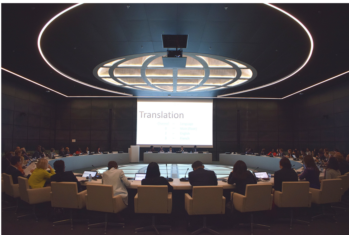
The Symposium was facilitated by the Ministry of Foreign Affairs of the Netherlands.