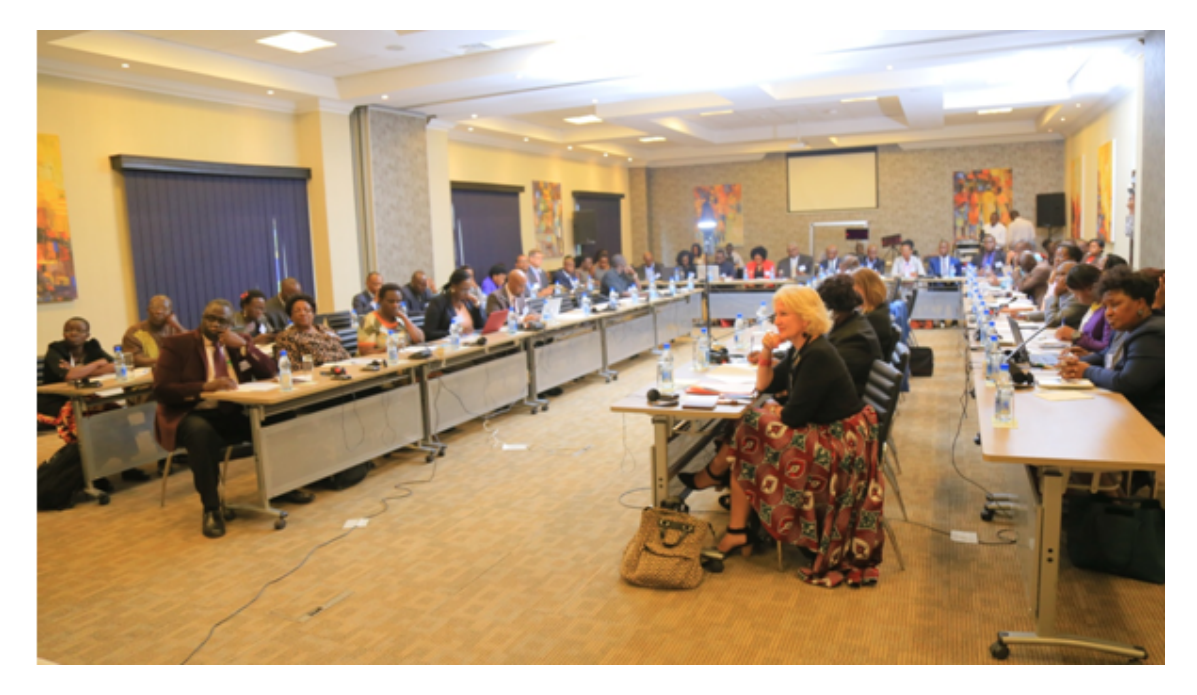
Stakeholders attending Africa Legal Aid's consultations in Kampala, Uganda, in July 2018.

In 2018 Africa Legal Aid (AFLA) held consultations with stakeholders from Central, Eastern and Western Africa on 'Emerging Trends on Complementarity'. Participants attended from Burkina Faso, Burundi, Cameroon, Central African Republic, Chad, Côte D'Ivoire, Democratic Republic of Congo, Equatorial Guinea, Eritrea, Ethiopia, Gabon, Gambia, Ghana, Guinea, Kenya, Liberia, Mali, Mauritania, Nigeria, Senegal, Sierra Leone, South Sudan and Uganda. They included members of the judiciary, prosecutors, civil societies, legal fraternities, academics, representatives of intergovernmental organisations and victims of atrocity crimes.