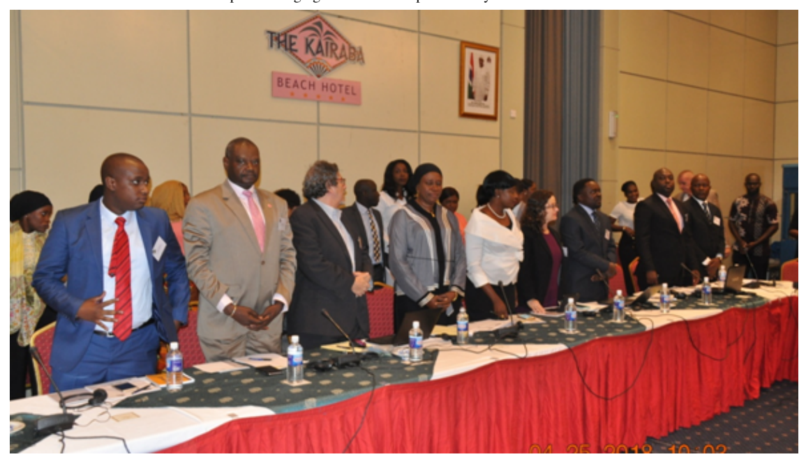
Stakeholders attending Africa Legal Aid's consultations in Banjul, The Gambia, in April 2018.