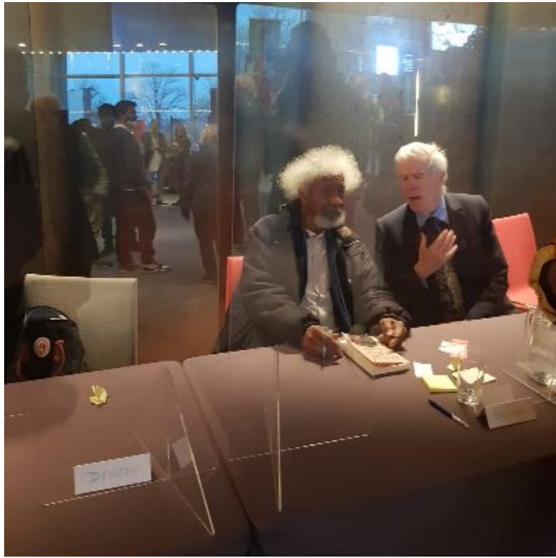
Holding his copy of Hague Girls Part One: Fleeing , the literary giant himself, Wole Soyinka, first black African to win the Nobel Prize for Literature.