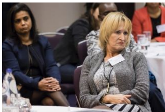
Judge Christine van den Wyngaert and Shamila Batohi. Ms Both served as senior legal advisor to the prosecutor of the ICC until 2018, when she was appointed national director of public prosecutions of South Africa by President Cyril Ramaphosa. She assumed office on 1 February 2019.