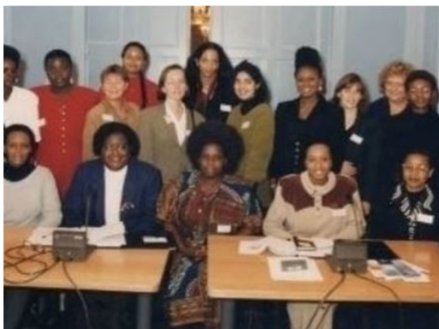
Women who participated in AFLA's first conference: The Legal Profession and the Protection of Human Rights in Africa , 1997.