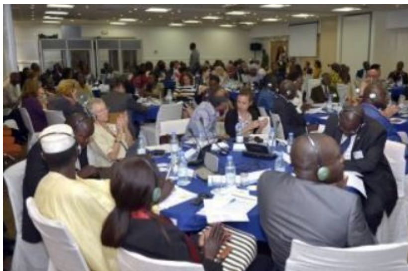
A full house at AFLA's Seminar on Complementarity, the Habré Trial, and the Evolution of Universal Jurisdiction, Dakar, 2016.