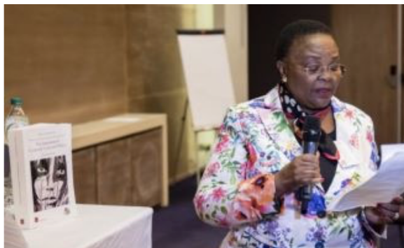
Judge Sanji Monageng launches AFLA book 4, The International Criminal Court and Africa: One Decade On .