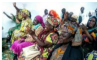
Victims cheering after Habré's conviction

To coincide with the Habré judgement, Africa Legal Aid (AFLA) in cooperation with the Baltasar Garzón International Foundation and the Kenya Human Rights Commission, convened a Seminar from 30th May - 1st June 2016 in Dakar, on ' Complementarity, the Habre Trial, and the Evolution of Universal Jurisdiction '. AFLA has been at the forefront of discussions on Universal Jurisdiction. It is of historical importance to note that under the auspices of AFLA, the 'Cairo-Arusha Principles on Universal Jurisdiction in Respect of Gross Human Rights Offences: An African Perspective', were adopted. AFLA obtained accreditation for the Seminar's participants: civil society organizations, legal fraternities, academics and opinion leaders, to attend the reading of the judgement.