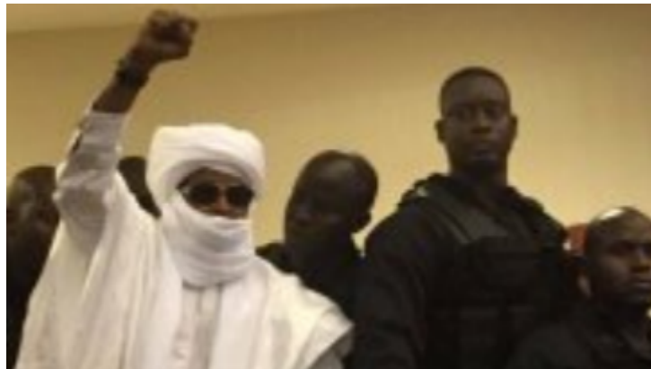
An unbroken, perhaps unremorseful Habré, responding to the cheers of his supporters

See here for the 'Cairo-Arusha Principles on Universal Jurisdiction in Respect of Gross Human Rights Violations from an African Perspective' adopted under the auspices of AFLA.