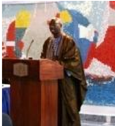
Adama Dieng at Africa Legal Aid Conference on Introducing the New African Court ... , Accra , 2006

tasked by the Security Council with collecting and assessing information on situations that might lead to genocide. In addition, the Office Mr. Dieng will lead (as U.N. Under-Secretary-General) is mandated to advise the Secretary-General and, through him, the Security Council, and make recommendations to prevent or halt genocide, as well as liaise with the UN system on preventive measures and enhance the UN's capacity to analyze and manage information on genocide or related crimes.