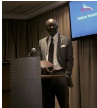
H.E. Adama Dieng at Africa Legal Aid Conference on Human Rights and Business in cooperation with Webber Wentzel, Johannesburg , July 2012

In his new position, Adama Dieng will continue in his quest to make the world and conflict prone Africa a better place. His activities will strengthen those of other international bodies including the International Criminal Court. Coming from a civil society background, an area that remains close to his heart, civil societies in Africa and elsewhere can count on the continued support and cooperation of this son of Africa, and the international community.