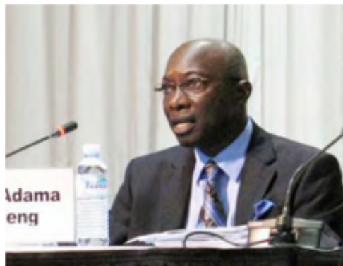
H.E. Adama Dieng