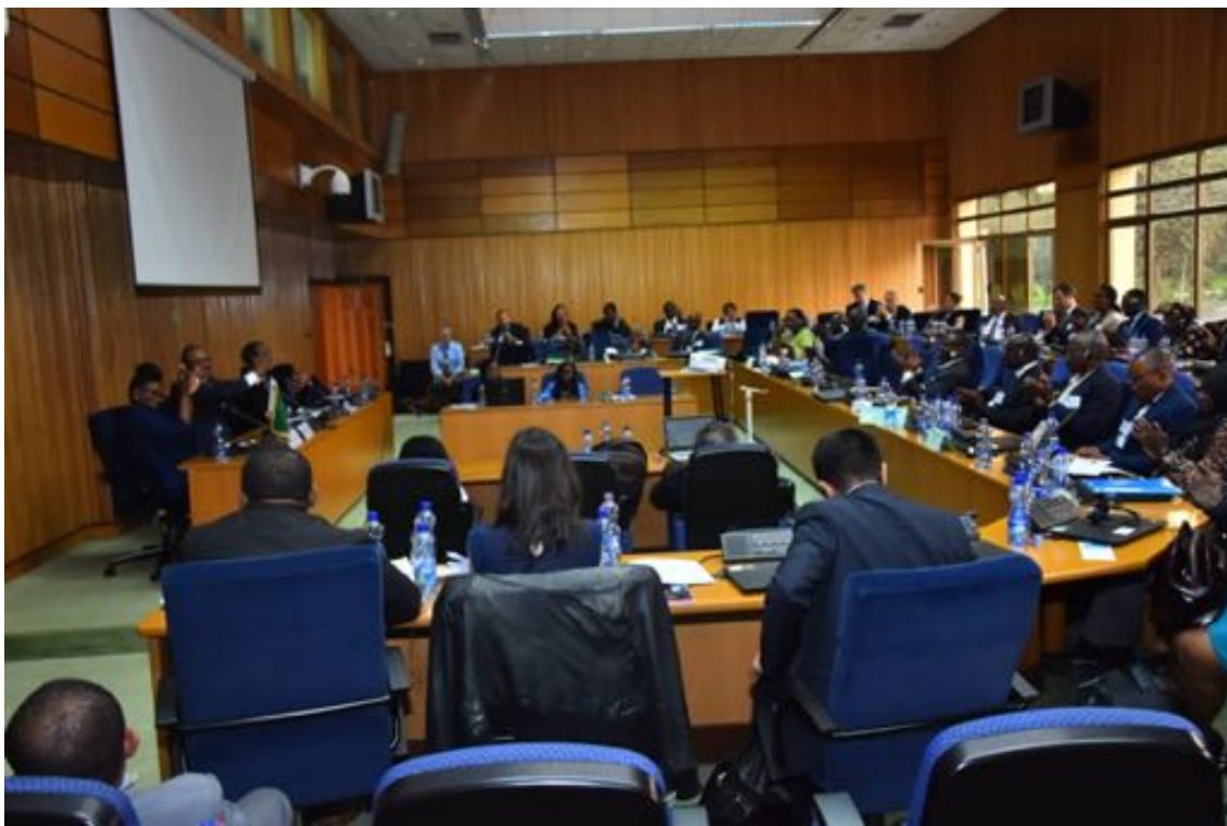
During the closing ceremony - A full house.