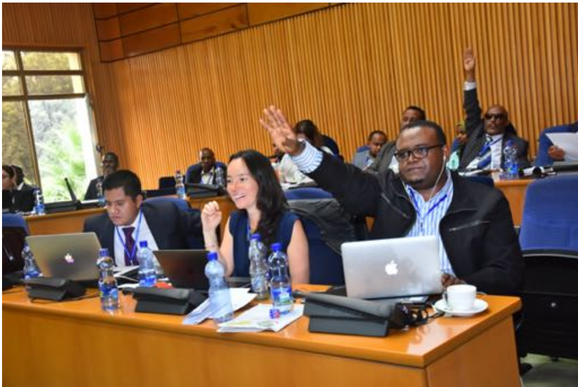
During the floor discussion of the final panel.