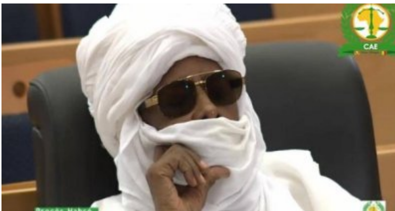
Hissène Habré

From 30 May - 1 June, Africa Legal Aid (AFLA), in cooperation with FIBGAR and the Kenya Human Rights Commission, will convene a Seminar in Dakar, Senegal on ' Complementarity, the Habre Trial, and the Evolution of Universal Jurisdiction. ' The meeting will coincide with the Habre judgement on 30 May. It is of historical importance to note that the trial in Senegal of the former Chadian leader by the Extraordinary African Chambers (EAC) is the first of its kind.