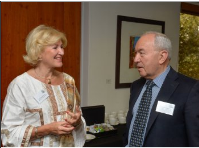
Ambassador Mirjam Blaak-Sow, Ambassador of Uganda to the Benelux with Justice Richard Goldstone.

and Gender Based Crimes; Victims, Witnesses and Defense; and Re-engaging Africa in the ICC.