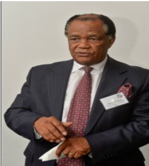
Judge Ngoepe, Former Member of the African Court on Human and People's Rights.