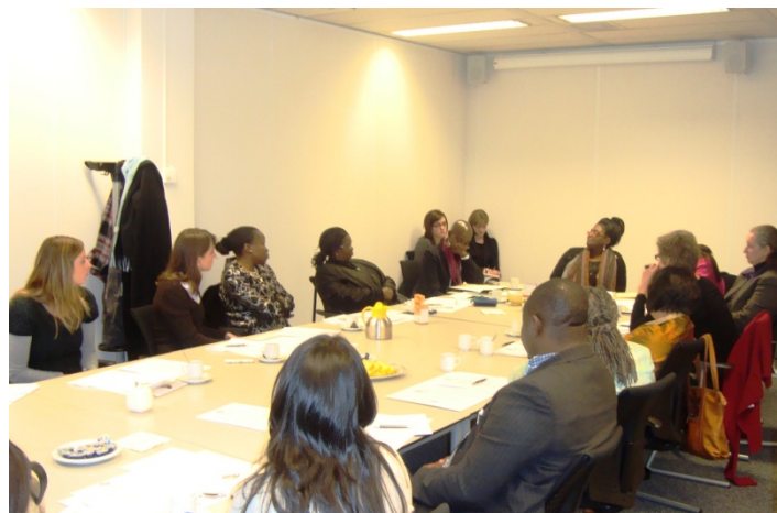
Participants of the Gender Meeting

Generally speaking, women have a very vulnerable position in society and for this reason happen to be the unfortunate victims of different forms of violence. Migrant women are yet in a weaker position as they live in an unfamiliar environment which subjects them to submission and dependence. These aspects together with