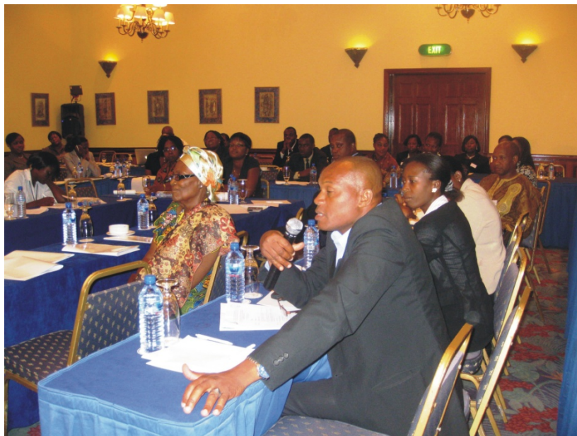
Participants during the Conference

The Forum addressed a variety of themes pertaining to gender-based violence, particularly, emerging and undertreated forms of violence. It ended with a Final Plenary which deliberated on expanding the list of offences that constitute Gender Crimes. It was noted at the beginning of the Forum that the outcome of the meeting will contribute to AFLA’s ongoing Gender Justice Campaign which will formulate principles and adopt a Policy Agenda for Gender Justice to be used for Advocacy and Lobbying Initiatives in Africa and elsewhere.