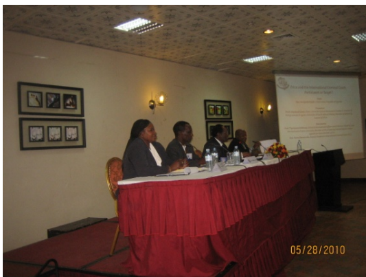
Panelists for the Theme " Is Africa a Participant or Target of International Justice "

The Conference attracted over one hundred participants including the President of the ICC who delivered the Keynote Address; the Prosecutor of the ICC; the President of the Assembly of State Parties (ASP) to the ICC; the Chief Justice of Uganda, judges and other officials of the newly established War Crimes (WCD) of the High Court of Uganda, officials of the Uganda government, the diplomatic community, academics, human rights and justice advocates, civil society representatives, members of the legal fraternity and the international justice community, as well as students. AFLA enlisted a world class faculty of Speakers from renowned international legal scholars and academics to opinion leaders in African communities.