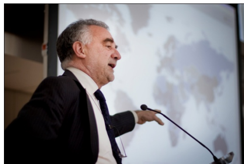
H.E. Luis Moreno Ocampo, Prosecutor

The objective of the Dialogue on The Bashir Arrest Warrant was to explore the South/North dimensions of the emerging regime of international criminal justice, and discuss the views of both proponents and opponents of the actions of the ICC. As well, the Meeting aimed at addressing the views of a third school of thought, who, while supporting international criminal justice, expresses concerns that its application may not be universal. This Dialogue also served to stimulate discussion on unsettling issues on the interface between peace and justice as well as the legitimacy of international criminal justice. The ultimate goal really was to contribute to an international justice regime that is, and perceived as legitimate, inclusive and effective.