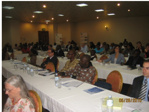
Participants during the Conference

The Meeting built on AFLA's longstanding activities aimed at pushing for progressive development of international criminal justice incorporating issues of real and practical significance for Africa.